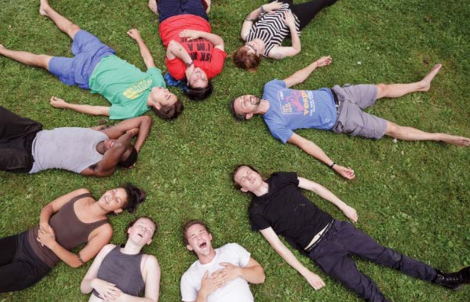
Above, teens join staff in a Primal Practice workshop that incorporates movement, sound, and play. Old Chatham, NY, summer 2015.